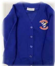
Royal Blue Cardigan