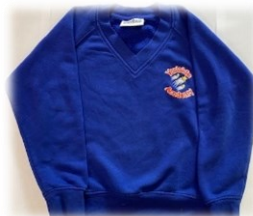
Royal Blue Sweatshirt