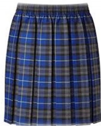
Tartan Pleated Skirt