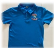
Royal Blue PE Top