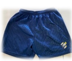
Blue PE Shorts