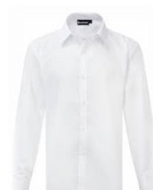
White Coloured Shirt